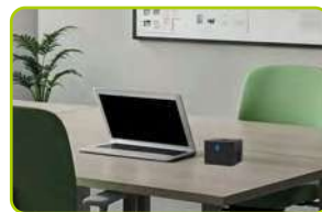
Where you work