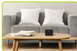
Where you relax