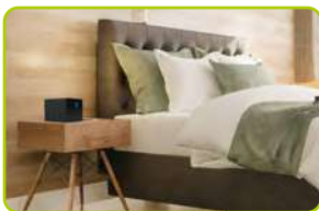
When you sleep