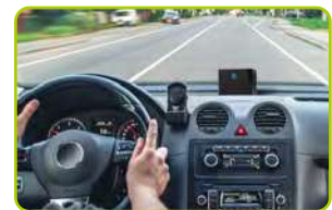
When you travel